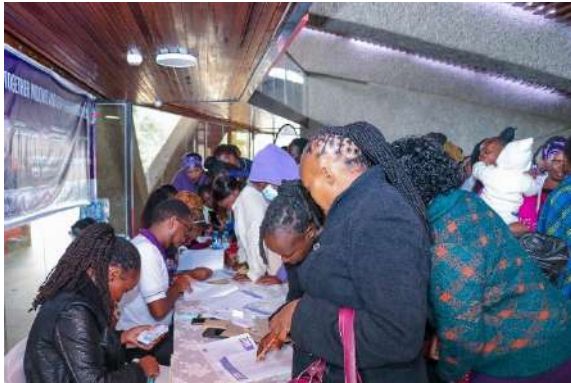
Registration and welcoming of participants from different Counties across Kenya

The event began with the registration and welcoming of participants from different counties across Kenya, providing an opportunity for widowed persons to interact, share their lived experiences, build networks, and strengthen their collective voice in advocating for their rights and dignity.