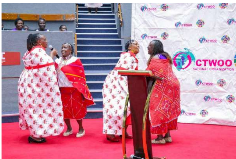
Osiligi Lenkolia Widows Group Entertaining the Participant through the Maasai Cultural Dance at KICC Nairobi-County